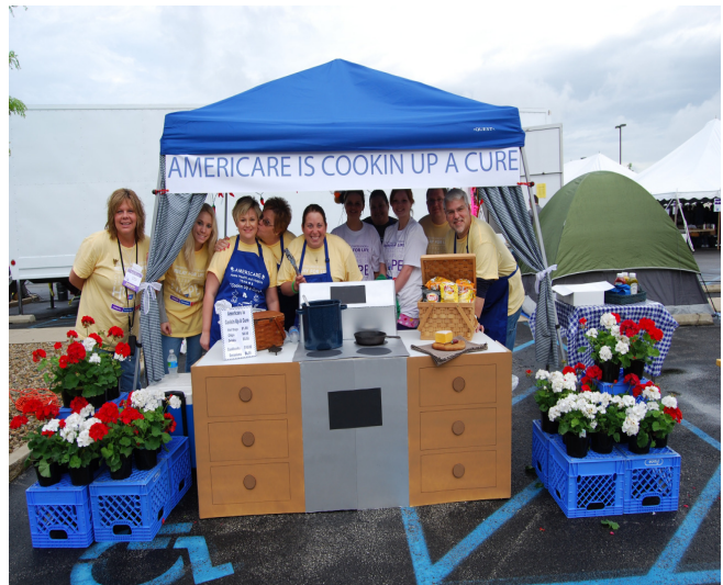
Pictured above is Americare’s Relay for Life Tent Relay For Life...Follow Up...

Americare participated in the 2009 Relay for Life and is proud to be a part of Johnson County, which raised a total of $107,000 towards cancer research. Americare won two awards this year: “Most Cancer Related Campsite” and the “Fight Back Champion Award.” There was also a total of 355 people that participated in the Cancer Prevention Study-3. Thanks to everyone in Johnson County that helped make this years Relay for Life a wonderful event.